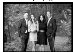
The Vescio Family vesciofuneralhome.com

Os melhores serviços funerários pelo melhor preço garantido.